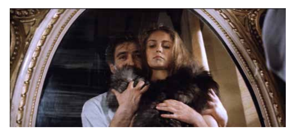
Figure 3. Shot from Jānis Streičs' film "Strange Passions" (1983)

The second method frequently used in films by Jānis Streičs is inclusion of screen shots or photos, and it has been done almost in all the films, starting with "Shoot Instead of Me". The occupation of the main character Jezups is screening of silent films – he is a film projectionist. In this film, a film screening becomes a deadly weapon in the hands of the protagonist (and he wins the evil). In the detective film "Unfinished Dinner" freeze frame is used as circumstantial evidence (the film is stopped for a moment and the voice-over comment explains whether the person or object seen in the shot has a decisive role in the subsequent investigation). In the film "Strange Passions" a white sheet is hung up in the dancing room and a