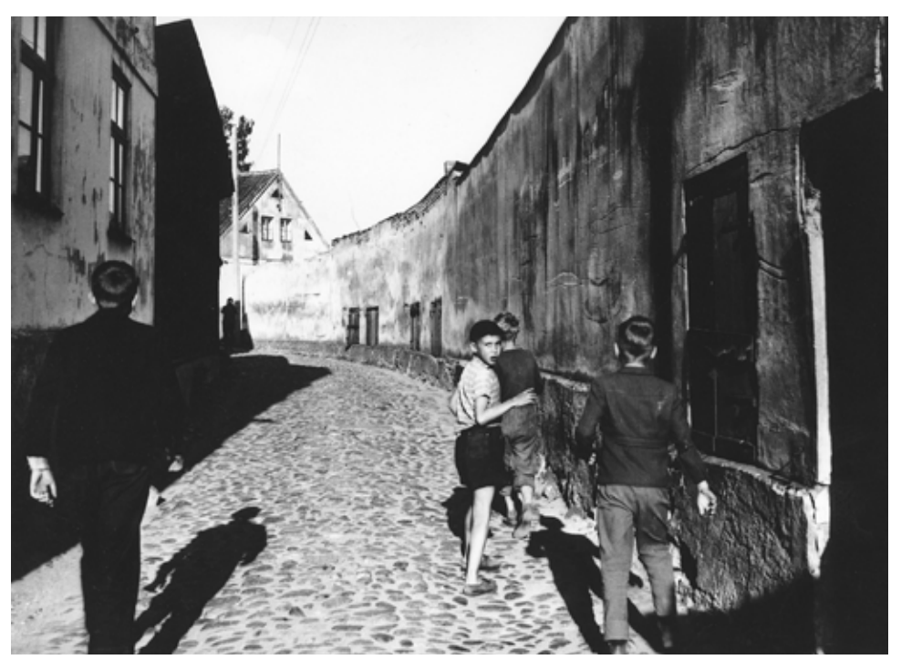
Figure 3. "Kuldīga Frescoes" (1966).

of the process started previously did not permit at the time to appreciate the need of the artist and the artistic trend for a manoeuvre, for enrichment of aesthetic experience (...)" [Savisko 1983].