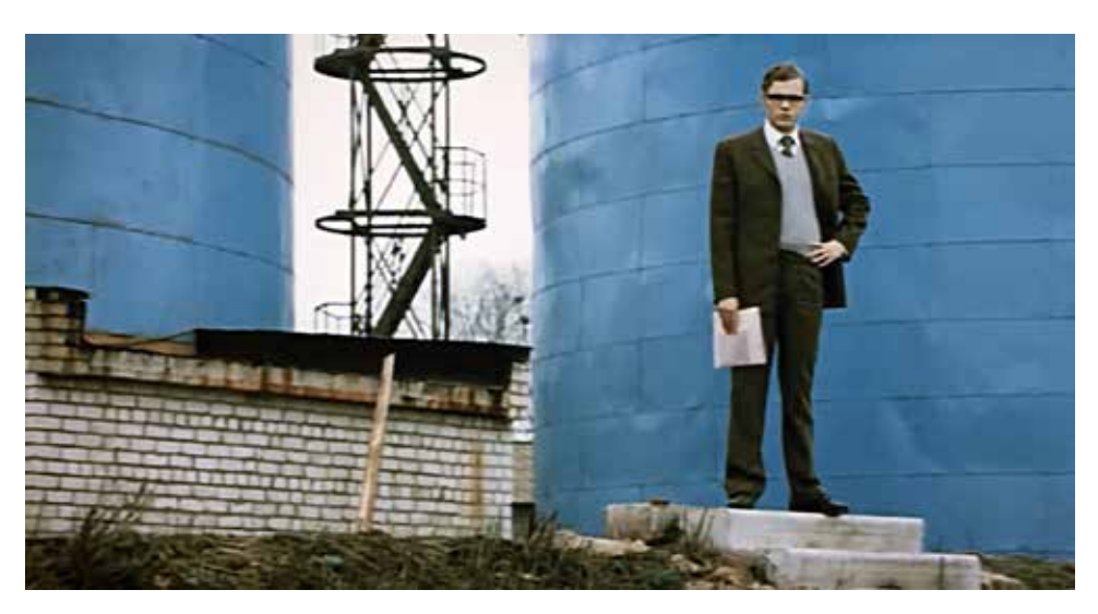
Figure 1. Shot from Jānis Streičs' film "My Friend a Light-Minded Man" (1975)

captured by Harijs Kukels are a means of telling the story of the film and never an aim in itself.