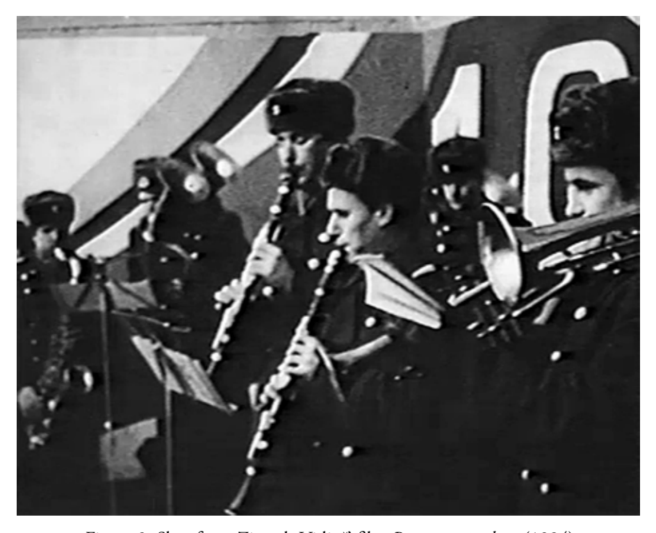
Figure 2. Shot from Zigurds Vidiņš' film Pa mūsmājas logu (1984)

The film finishes with footage of the park in winter, and we see a frontal shot of the Nativity of Christ Cathedral ( Kristus Piedzimšanas Pareizticīgo Katedrāle ), one of the majestic edifices that can be seen from inside the park. The Cathedral shot and the views of the park in snow suggest the holy time of Christmas, a very