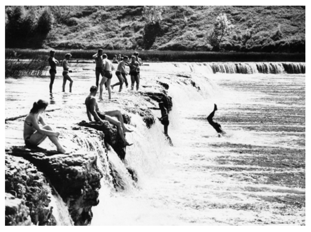
Figure 2. "Kuldīga Frescoes" (1966).

created – someone moves a piece, then the second and the third one and finally they all "fall" into a pattern no one could imagine before" [Jēruma 2009: 90 - 91].