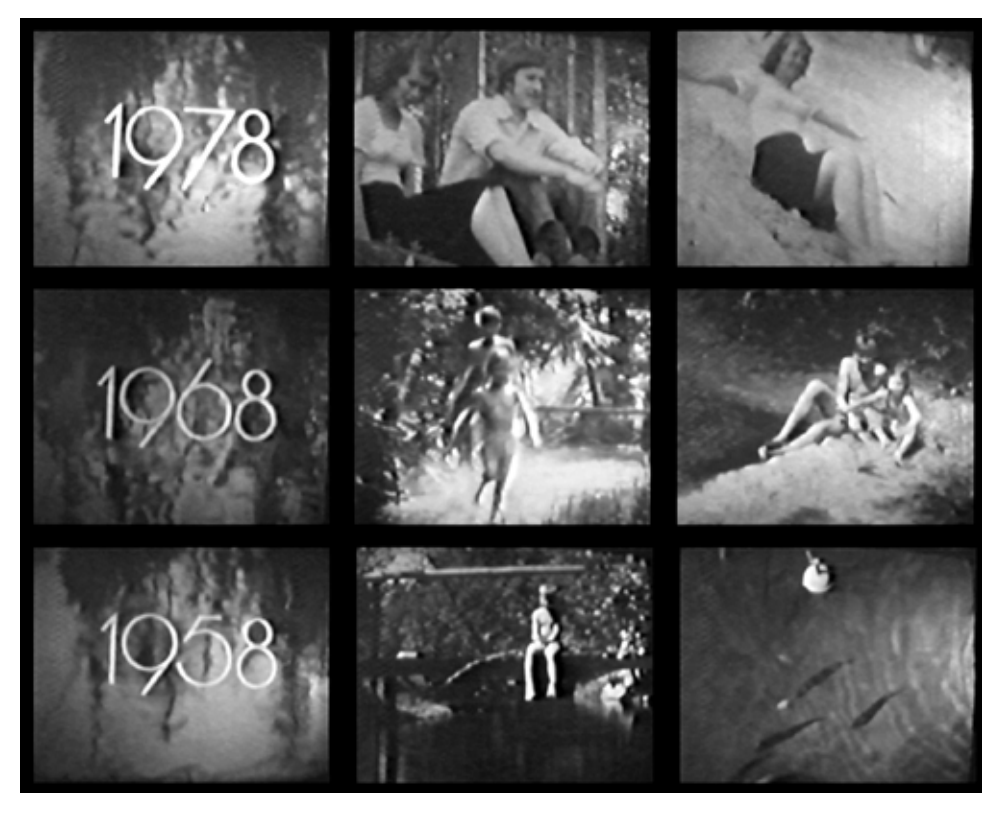
Figure 1. Shots from Uldis Lapiņš' film Lāčupīte (1958–78)

The poem was written by Aspazija during exile in Switzerland; in the context of Lapiņš' film (he lived most of his life in Latvia), the land of longing can be interpreted as his family's past.