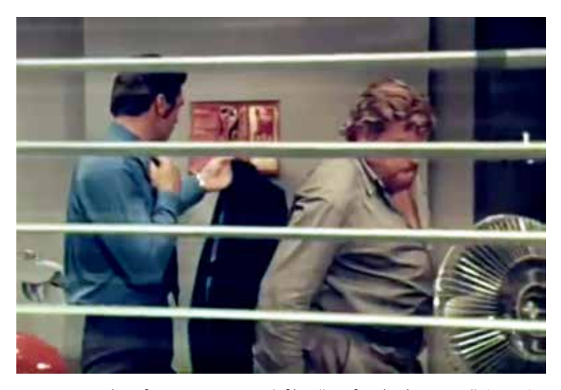
Figure 2. Shot from Jānis Streičs' film "Unfinished Dinner" (1979)

The second method frequently used in films by Jānis Streičs is inclusion of screen shots or photos, and it has been done almost in all the films, starting with "Shoot Instead of Me". The occupation of the main character Jezups is screening of silent films – he is a film projectionist. In this film, a film screening becomes a deadly weapon in the hands of the protagonist (and he wins the evil). In the detective film "Unfinished Dinner" freeze frame is used as circumstantial evidence (the film is stopped for a moment and the voice-over comment explains whether the person or object seen in the shot has a decisive role in the subsequent investigation). In the film "Strange Passions" a white sheet is hung up in the dancing room and a