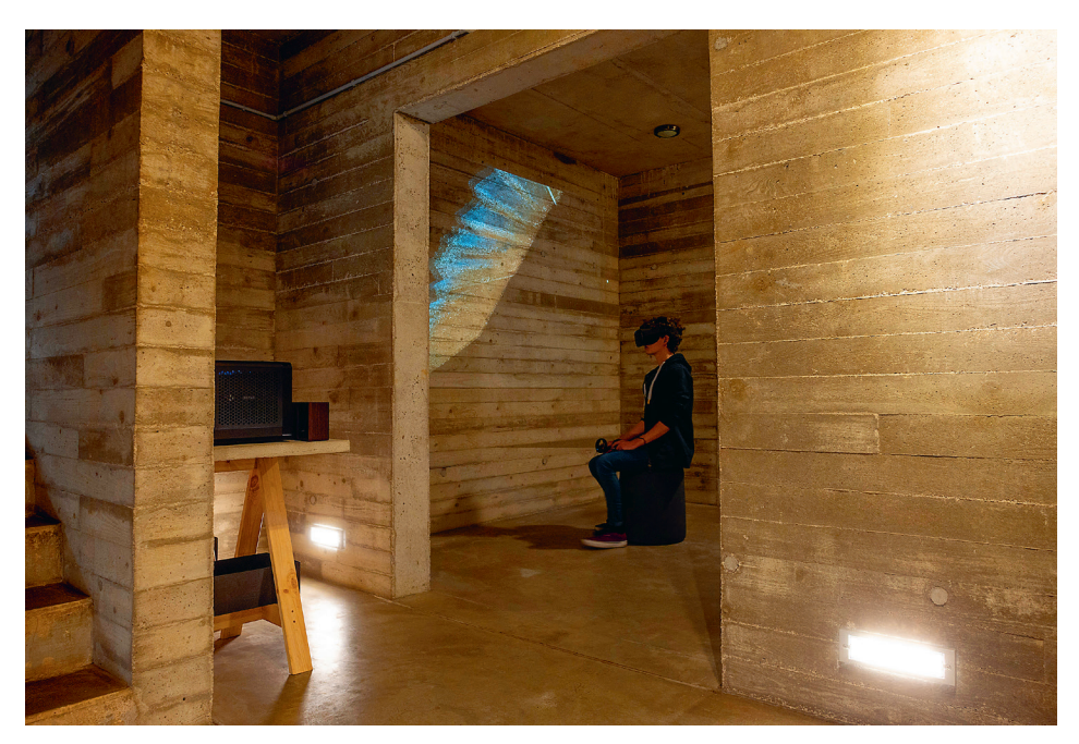
Figure 2. VR Space at the Žanis Lipke Memorial.