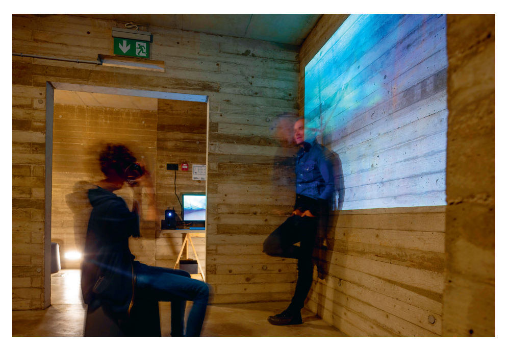
Figure 3. VR Space at the Žanis Lipke Memorial.