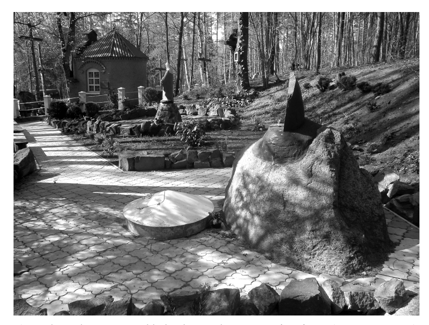
Fig. 1. The Eršketynė natural holy place in the vicinity of Darbėnai (Kretinga District). The holy stone has already been transformed into a base for a granite plaque with Christian symbols carved in it. Moreover, all the Christian elements (buildings, figurines and structures) contradict the concept of the naturalness of natural holy places.

In conclusion, it should be stressed that nature and natural are absolutely normal characteristics of the Balts' holy places, both with regard to the surrounding space and character of the place itself. The term natural holy place is relevant when dealing with the Balts' holy places and discussing them in English.