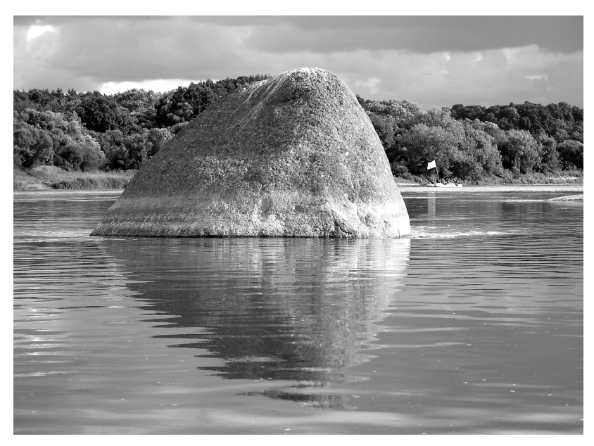
Fig. 2. The Rooster's Stone (Gaidelis) near Krėslynai village (Jonava District) – the largest boulder in the River Neris. Place legends indicate the sacred significance of the site.

water. Annual festivals connected with the River Neris used to cover almost the whole annual cycle.