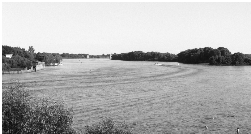
Fig. 1. The River Volkhov at Novgorod.

The eldest son of that Prince Sloven – Volkhov – was a demon worshipper and a fierce sorcerer among the people, and worked marvels by the devices of the Devil, and by changing into the form of a ferocious crocodile beast, he blocked the waterway along the River Volkhov. And among those who did not worship him, he devoured some, and drowned others by casting them out (of their ships). Therefore, the people, ignorant at the time, presumed that cursed man to be the true god, and called him Perun ('Thunder'). So, that cursed sorcerer built a town in a place called Perynya, where Perun's idol stood, for night rites and demon assemblies. And the ignorant spoke about Volkhov: he sits as a god. And our true Christian work against that cursed sorcerer and magus – he was killed and strangled by demons in the River Volkhov, and by the devices of demons his body was taken up the Volkhov and thrown onto the bank, across from that wizard-town Perynya. And the ignorant people wept a lot when burying the cursed one with a pagan funeral feast. And a high grave mound was made for him, as is usual among the pagans. Three days after the burial, the earth gave way and devoured the vile body of the crocodile. And the grave mound above him fell straight to the bottom of Hell. And up to the present day, they say that pit remains there and does not fill (Гиляров, 1878, 15–17).