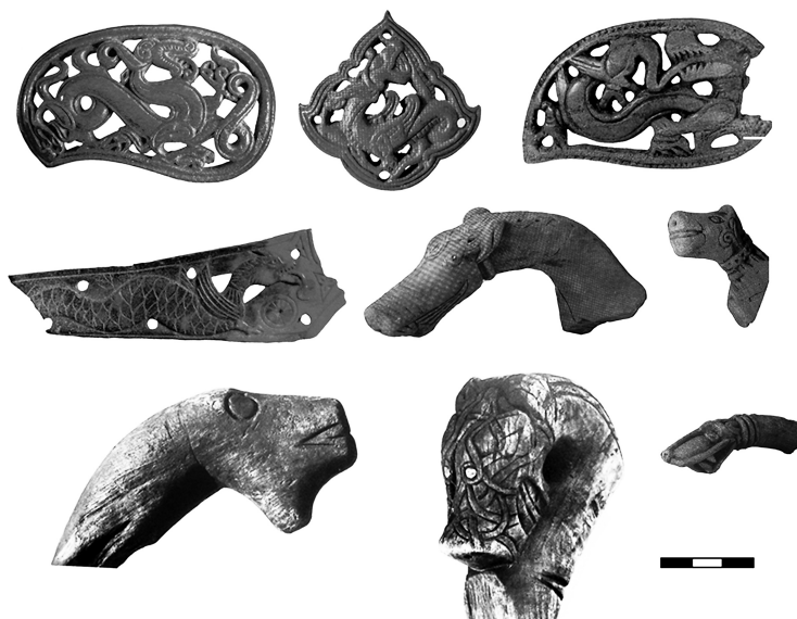
Fig. 2. The fairytale snake on craft items of the medieval period from Novgorod.

dicated by the popularity of portraying a fairytale snake in the Novgorod arts and crafts of the medieval period (Fig. 2), which was probably directly connected with the cult of Volkhov, if the personified deity had a snake-like image. The indication of shapeshifting of the sorcerer prince Volkhov witnesses that the river deity could have been represented by an anthropomorphic image as well.