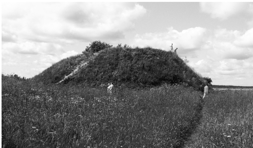
Fig. 5. A sopka – a typical burial and sacred monument in north-western Russia in the 9th–10th century AD.

archaeologists from St Petersburg, V. A. Bulkin and N. Ya. Konetskiy, confirmed that the discovered complex represents the remainder of a group of sopka 's – a typical burial and sacred monument of north-western Russia in the 9th–10th century AD (Fig. 5) (Конечский, 1995, 80–85; Клейн, 2004, 152–157). This in no way contradicts the assertion that a pagan sanctuary was located at the site of Peryn, because sopka 's were a traditional place for performing cult activities for the people of the Novgorod land. This reconstruction of the sanctuary also corresponds to the mention of a huge burial mound in the legend of Volkhov, under which the sorcerer was buried. Probably, it was this sopka , the largest ever discovered, where the night rituals relating to the cult of Volkhov were performed. The sopka 's of Peryn were destroyed already in the medieval period, hence the motif of the 'sunken grave' in the legend of Volkhov.