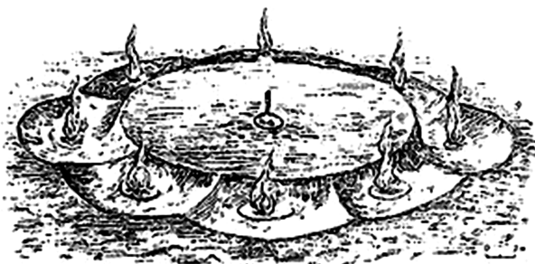
Fig. 4. Reconstruction of the Peryn sanctuary (after Седов, 1953).

stone pavings (Fig. 3). Pits with pillars were also discovered, which could have served for erecting idols. The discoverer of the Peryn complex, V. V. Sedov, reconstructed it as an open-plan sanctuary with nine idols, one of which (Perun?) was located at the centre (Fig. 4) (Седов, 1953, 92–103). However,