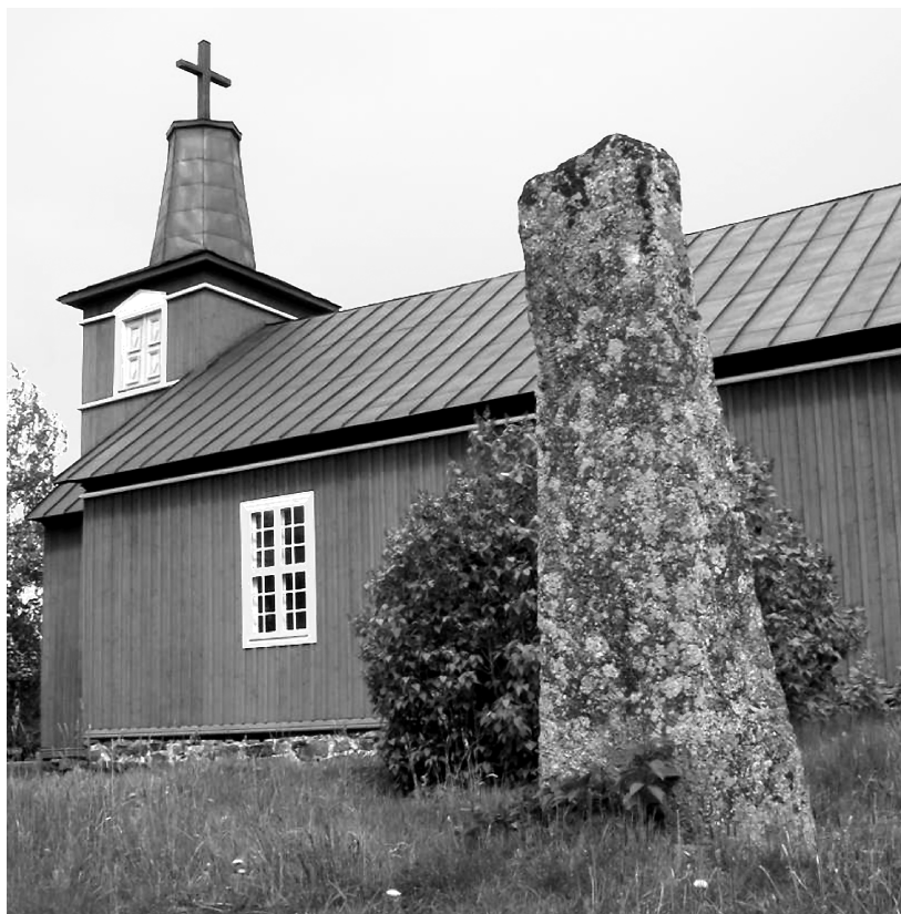
Fig. 2. In South-West Finland and Estonia, a stone-throwing giant is often called Kalevanpoika (Est. Kalevipoeg 'Kaleva's/Kalev's Son'). In the foreground is 'Kaleva's Son's whetstone for his scythe', over 2.5 m tall, in Untamala churchyard in Laitila, which has turned out to be a medieval tombstone ( Kivikoski , 1955, 65).

century by C. Ganander, there is also a giant resembling Koljo called Kole , found in Swedish folklore.