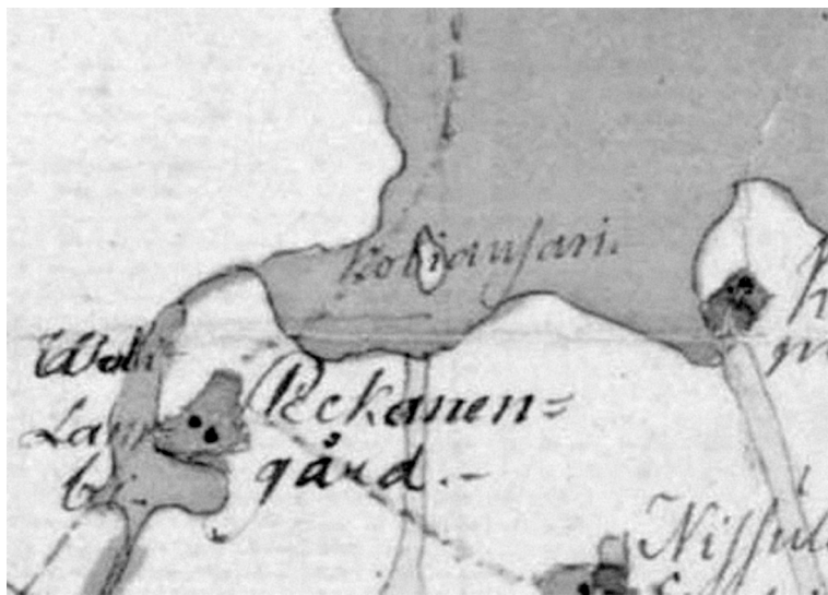
Fig. 5. Koljonsaari (Koliansari) Island in Lake Ala-Kintaus, parish of Petäjävesi on the 1750s map (MHA 41, KA).

dating from the turn of the 18th century has been discovered in research (Ruohonen, 2007, 15–20; see also Tigerstedt 1877, 40).