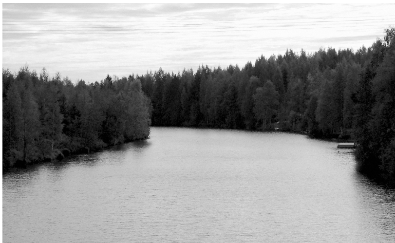
Fig. 4. Koljonvirta ('Koljo's Stream') in Iisalmi is a wide and fast-flowing stream connecting the Pikku-Ii and Porovesi lakes.

Koljonmäki ( mäki 'hill'), Koljonvuori ( vuori 'high hill, mountain') and Koljonvirta ( virta 'stream'). In these toponyms the meaning of the root koljo most probably reflects the vast, even giant-like size of the site. These places also resemble each other across a wide geographical area. For example, the steep and rocky hill of Koljonvuori in Pusula, Uusimaa Province exhibits the same topographical elements as Koljonmäki hill, situated in Rautjärvi, Karelia, close to the present eastern border. Further examples include a high hill in Swedish Ylitornio, called Koljo or Koljovaara , and a large boulder in the River Tornio, Lapland, called Koljonen . Koljonvirta ( virta 'stream') in Iisalmi, Northern Savo is a wide and fast-flowing river connecting together Pikku-Ii and Porovesi lakes (Fig. 4).