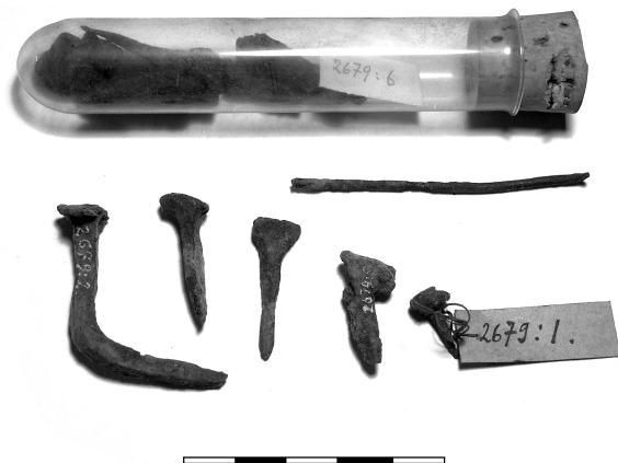
Fig. 1. Finds collected during archaeological excavation at the offering tree Ülendi Ebajumal (Idol) in Hiiumaa (AI 2679). Iron nails and pieces of corroded iron were found beneath the tree.