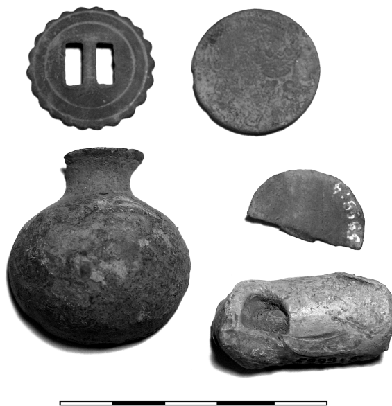
Fig. 2. Finds recovered beside the split boulder at Kumna (AI 5999).