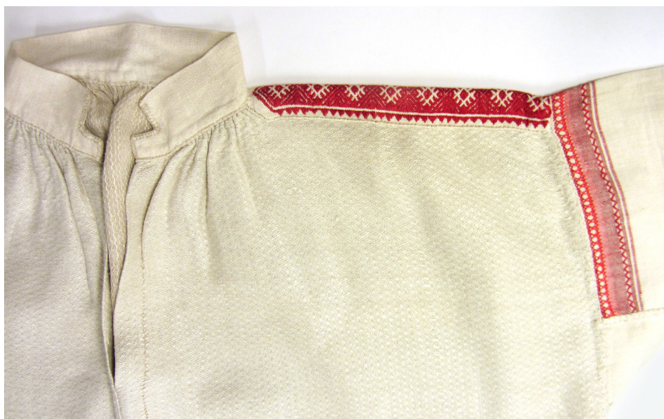
Figure 1. Fragment of the female festive shirt (CVVM 12753) from Šķilbēni municipality in Latgale, Latvia. Collection of the National History Museum of Latvia.

Many collections around the world use the English-based but widely translated AAT thesaurus to describe garments. This hierarchical taxonomy is a very useful start to cast our net to find potential Latvian kreklis in a foreign collection. Latvian men's and women's shirts were similar, with subtle distinctions in length and decor. While they could feature decorative elements, they could also be undecorated, making the differences minimal and sometimes barely noticeable. TextileBase can extend AAT with custom categories to better bridge cultural garment types, for example, distinguishing chemise and the kreklis by adding its wearer – Latgalian or Livonian women. From now on, we can go hunting for further female shirt data.