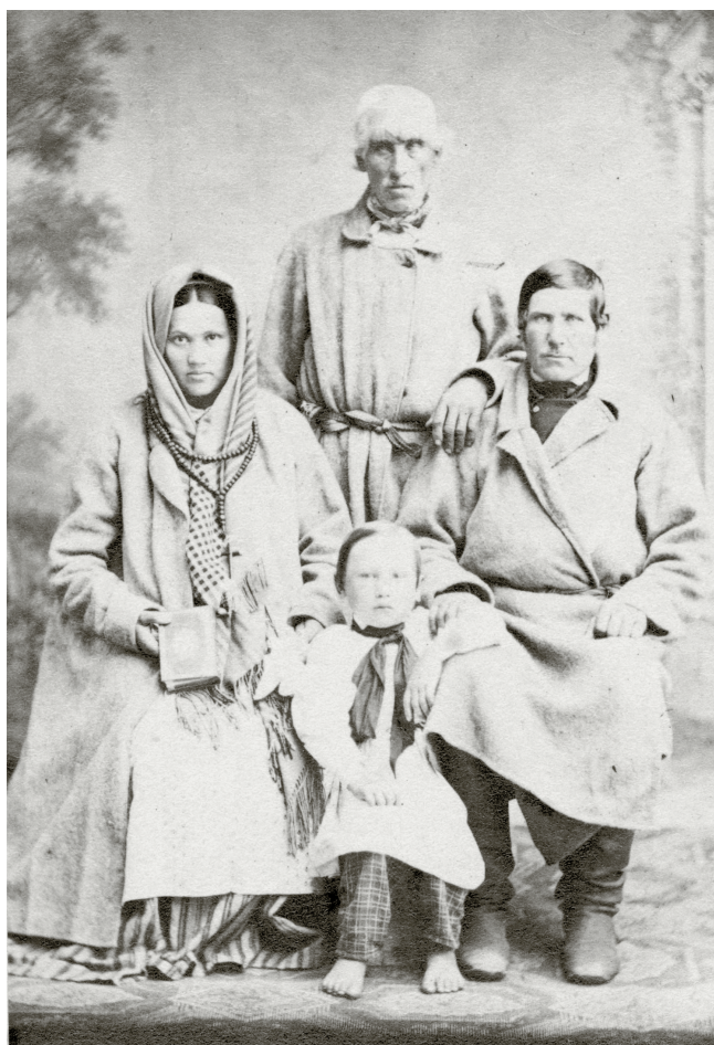
Figure 2. Latvians from Daugavpils area in 1869. A photograph published by Gustav von Manteuffel. [Manteuffel 1869: 43.]

Archive catalogue searches using keywords like “linen” or “shirt” often yield little, especially with niche descriptors, like “linen”, “shirt” “traditional tunic cut”, “sewn by hand”, “1851–1900”. However, archival records (documents) often have much more precise dating than museum collections. Unless we are lucky to investigate a special dress history collection within an archive, we will likely search for images of people – for example, women, or more specifically, peasant women – from 1851 to 1900. Most images made of women in this period show the women fully clad. This is important, because we see their garments.