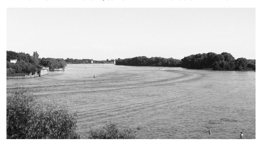
Fig. 1. The River Volkhov at Novgorod.

The eldest son of that Prince Sloven – Volkhov – was a demon worshipper and a fierce sorcerer among the people, and worked marvels by the devices of the Devil, and by changing into the form of a ferocious crocodile beast, he blocked the waterway along the River Volkhov. And among those who did not worship him, he devoured some, and drowned others by casting them out (of their ships). Therefore, the people, ignorant at the time, presumed that cursed man to be the true god, and called him Perun ('Thunder'). So, that cursed sorcerer built a town in a place called Perynya, where Perun's idol stood, for night rites and demon assemblies. And the ignorant spoke about Volkhov: he sits as a god. And our true Christian work against that cursed sorcerer and magus he was killed and strangled by demons in the River Volkhov, and by the devices of demons his body was taken up the Volkhov and thrown onto the bank, across from that wizard-town Perynya. And the ignorant people wept a lot when burying the cursed one with a pagan funeral feast. And a high grave mound was made for him, as is usual among the pagans. Three days after the burial, the earth gave way and devoured the vile body of the crocodile. And the grave mound above him fell straight to the bottom of Hell. And up to the present day, they say that pit remains there and does not fill (Гиляров, 1878, 15–17).