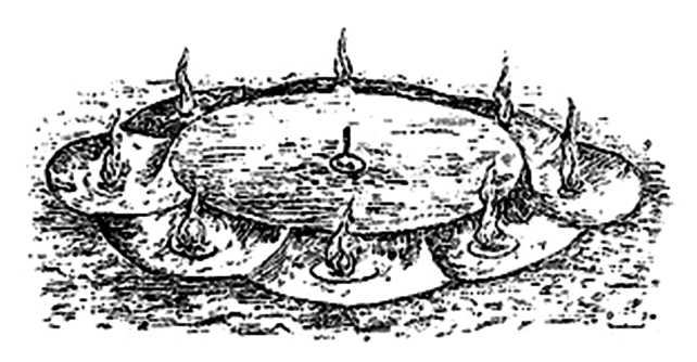
Fig. 4. Reconstruction of the Peryn sanctuary (after Cedos, 1953).

stone pavings (Fig. 3). Pits with pillars were also discovered, which could have served for erecting idols. The discoverer of the Peryn complex, V. V. Sedov, reconstructed it as an open-plan sanctuary with nine idols, one of which (Perun?) was located at the centre (Fig. 4) ( Ceòos , 1953, 92–103). However,