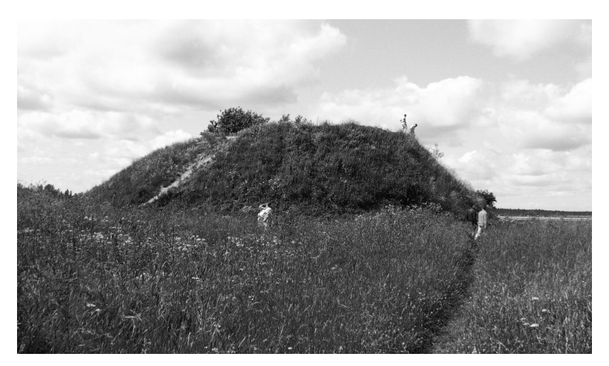
Fig. 5. A sopka – a typical burial and sacred monument in north-western Russia in the 9th–10th century AD.

archaeologists from St Petersburg, V. A. Bulkin and N. Ya. Konetskiy, confirmed that the discovered complex represents the remainder of a group of sopka 's – a typical burial and sacred monument of north-western Russia in the 9th–10th century AD (Fig. 5) ( Koheukuŭ , 1995, 80–85; Κλεŭμ , 2004, 152–157). This in no way contradicts the assertion that a pagan sanctuary was located at the site of Peryn, because sopka 's were a traditional place for performing cult activities for the people of the Novgorod land. This reconstruction of the sanctuary also corresponds to the mention of a huge burial mound in the legend of Volkhov, under which the sorcerer was buried. Probably, it was this sopka , the largest ever discovered, where the night rituals relating to the cult of Volkhov were performed. The sopka 's of Peryn were destroyed already in the medieval period, hence the motif of the 'sunken grave' in the legend of Volkhov.